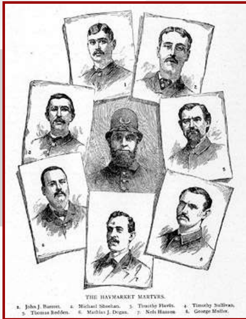
The eight policemen who died in the ensuing riot