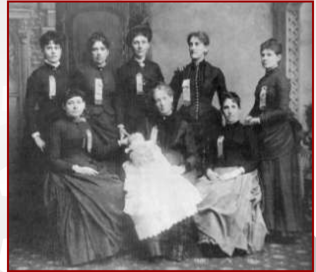
Women Delegates, Knights of Labor Convention