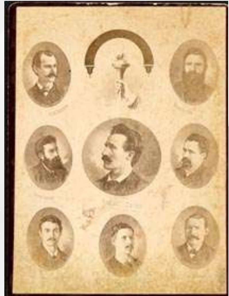
Card showing Haymarket defendants