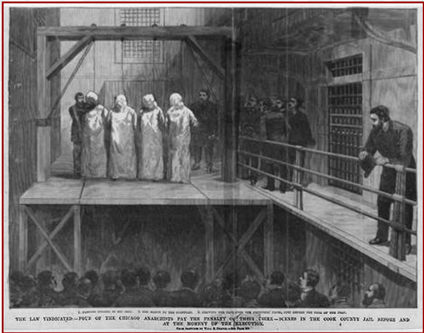
"The Chicago Anarchists Pay the Penalty of their Crime" Frank Leslie's Illustrated Newspaper , November 19, 1887